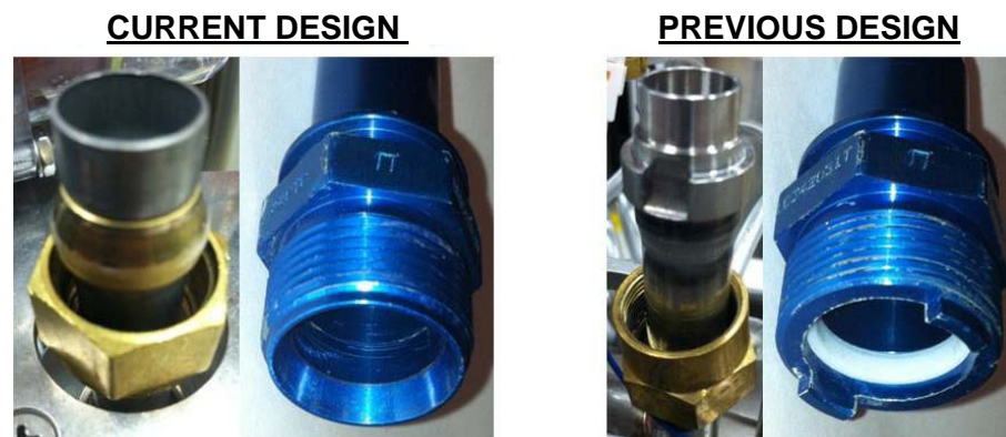
Figure 1 - - Liberator Manifold Design Change

The connection from the manifold to top-fill QDV's was changed from a Posi-Lock connection to a 5/8-inch compression fitting connection. All top-fill Liberator tanks produced after July 2012 contain the compression fitting connection on the manifold. This manifold design change is illustrated in Figure 1 below.