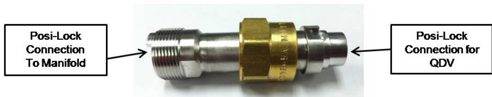
Figure 3 - - QDV Extension Comparison