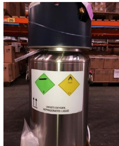
Figure 2: Label Affixed on Reservoir