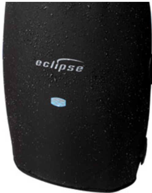
Figure 2 -- Eclipse Protective Cover