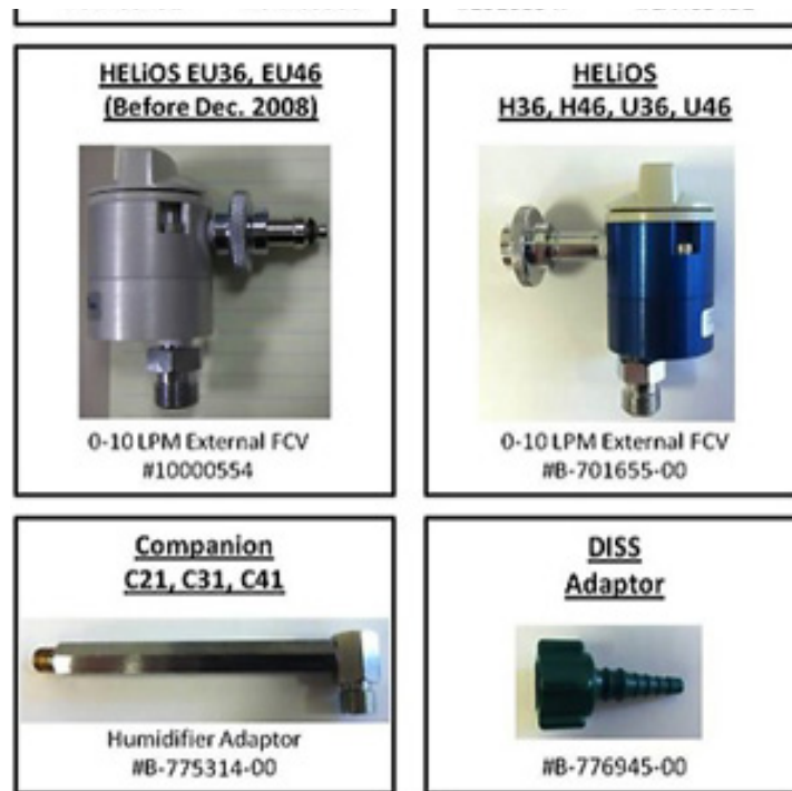
Figure 1 -- Adaptors and Extensions Guide