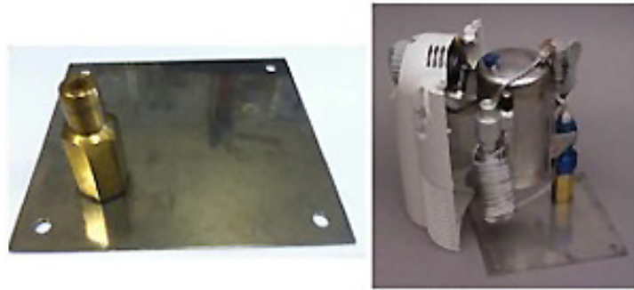
Figure 4 -- Portable Test Fixture