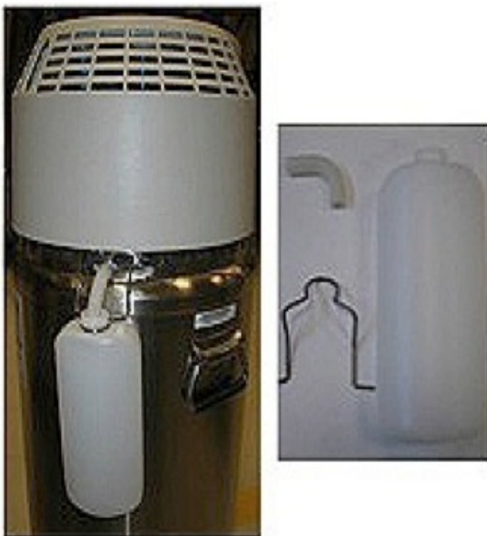
Companion Reservoir Drain Bottle Kit

A drain bottle kit is available for the Companion Reservoirs. The kit contains used to attach it to the reservoir, and the tubing elbow to route the moistur part number B-701362-SV.