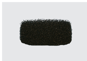
SPARE INTAKE FILTER