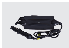
DC POWER SUPPLY