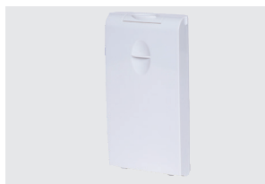
EXTRA BATTERY PACK