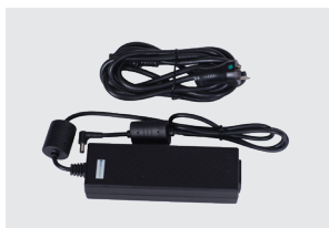
AC POWER SUPPLY (CORDS AVAILABLE SEPARATELY)