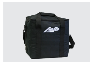
CARRY-ALL ACCESSORY BAG