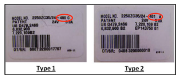
Image above denotes location of the "-400" and "-401" codes on each type of label.

Before beginning the repair and replacement, you will first need to determine the Type of compressor that is currently in Eclipse that you are servicing. The easiest way to do this is to visually examine the label on the front of the compressor box. "-400" compressors are Type 1, and "-401" compressors are Type 2.