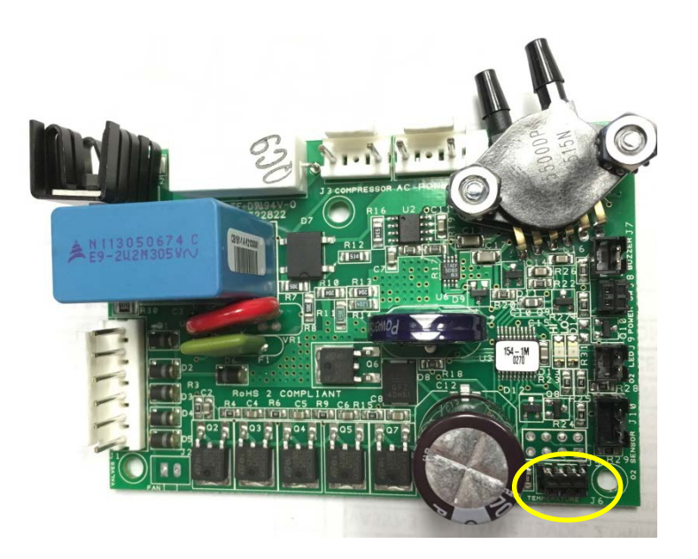
CB102-1 or CB151-1 (all voltages) Manufactured w/Temperature Probe connection

See below for pictures of the boards for visual comparison.