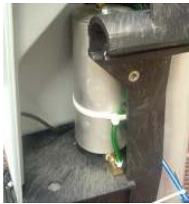
Part Number: TA132-1S

The product filter is designed to last for the life of the unit.