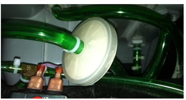
Part Number: FI001-1

Whether inside the product tank or an external component to this tank, there is no required or scheduled replacement needed for this part.