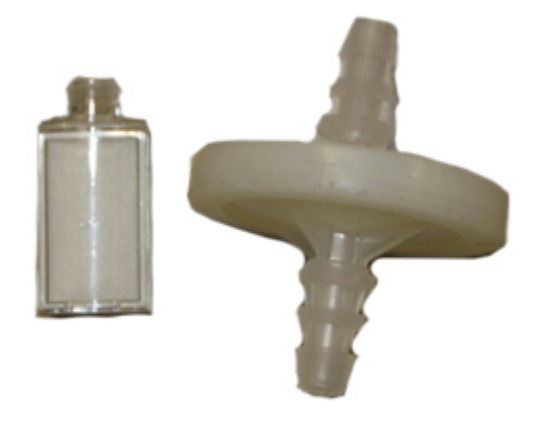
Replacement HEPA Filter Parts New 9765-SEQ (left); Old 6986-SEQ (right)