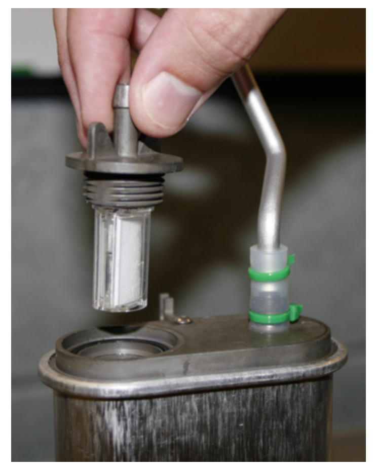
HEPA Filter Being Attached