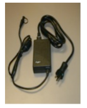
SeQual Eclipse DC Power Hints