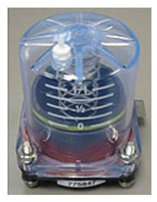
AirSep FreeStyle Sleep Mode

Following these steps is important to prevent damage to the contents indicators and prolong their useful life.