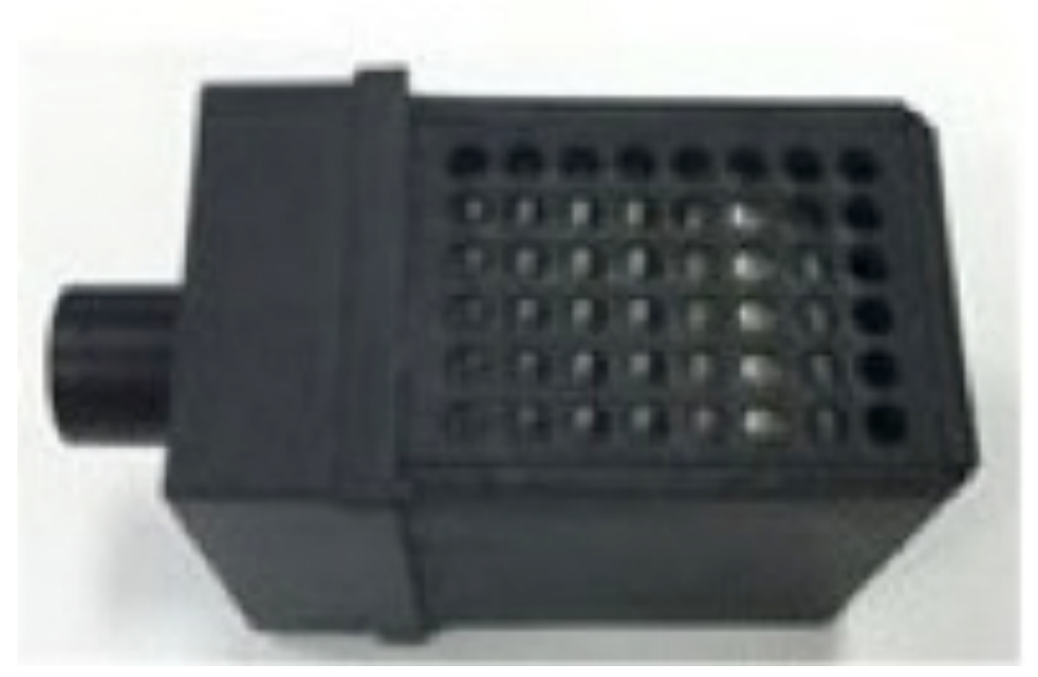
Old Style (PN 2607-SEQ)

CAIRE has changed the compressor inlet filter for the Integra 10 L stationary oxygen concentrator to a new style. The new style is different in color and shape and does not change the functionality of the unit.