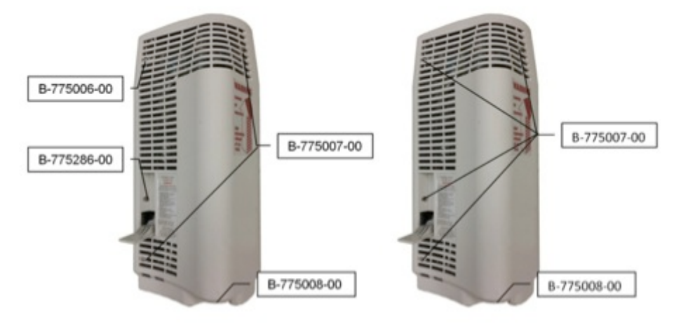
Integra Compressor Filter Change

CAIRE has updated the screws used on the C1000 liquid oxygen portables. A number of the screws used on the C1000 case are similar in size. Therefore, CAIRE has consolidated the the various types of screws necessary for the case. Only two types of screws will now be used for the C1000 case. This allows for easier and simpler service. Please see the photos below for details regarding the newly updated part numbers.