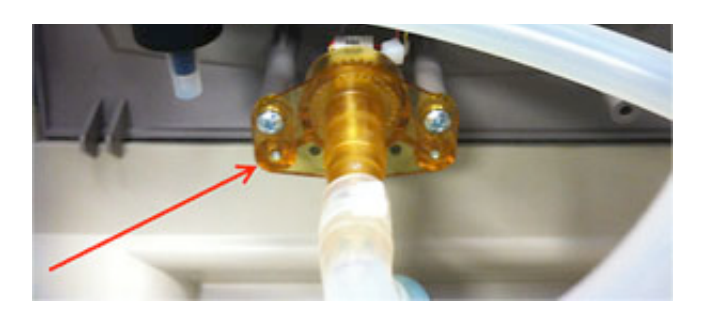
Eclipse ATF Replacements

Use the table below as a guideline to order replacement ATF assemblies for the Eclipse concentrators. The part number for ordering varies between model of the Eclipse. It is important that the correct ATF be installed in an Eclipse to ensure proper operation.