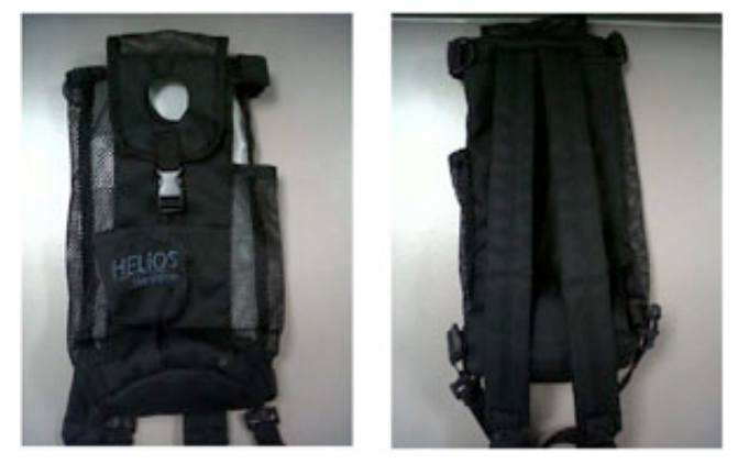
Eclipse 2+ Upgrade

The Marathon backpack, shown below, can be ordered using part number <u>#069209</u>.