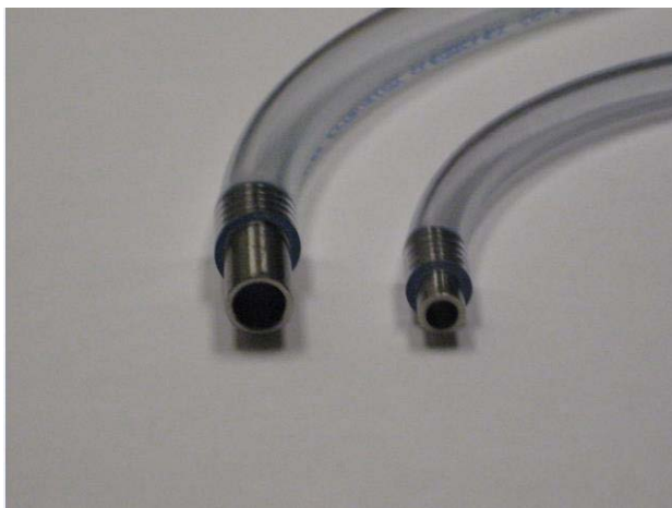
Updated Style Drain Tube (Left, PN 20818093) and Previous Style drain tube (Right, PN 14224662)

The Liberator reservoirs have been manufactured with a larger drain tube inside of the condensation pan since 11/24/2014. The change was made to reduce the possibility of the tube becoming blocked while the unit collects condensation.