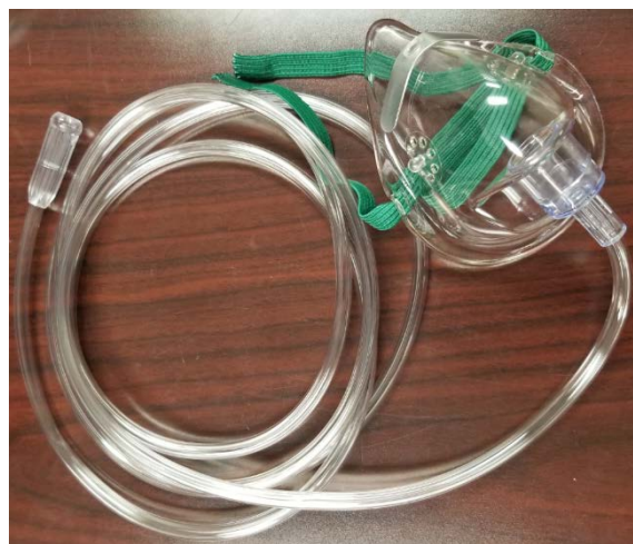
CU007-1: MASK, PEDIATRIC, CONCENTRATION, W/7' TUBING

All the other Oxygen delivery accessories are accessible in the CAIRE Knowledge center web site. Please use the below link for the Oxygen Delivery and Cannulas Accessory Sheet: