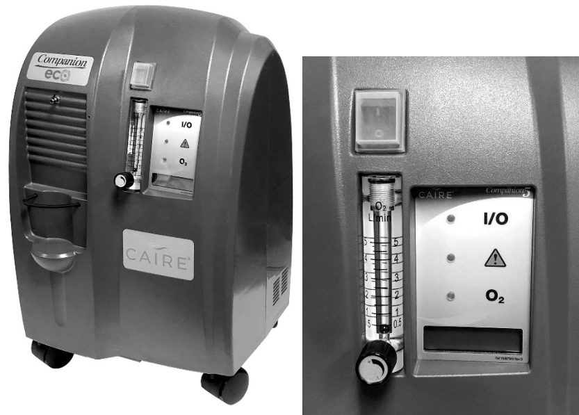
Figure 1. Updated Companion 5 Exterior

For customers in Europe who previously ordered item 15067021, going forward 21471908 or 21471909 are the available substitute items. Item 15067021 will still be available as necessary depending on product registration requirements for countries outside the EU.