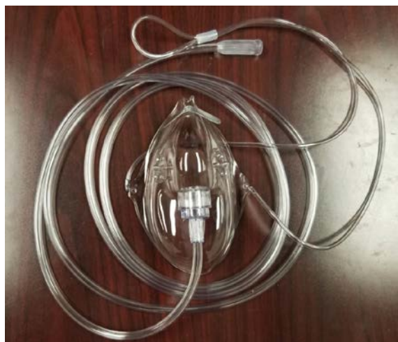
CU006-1: MASK, CONCENTRATION, OVER THE EAR STYLE W/7' TUBING

In addition to the standard cannulas, CAIRE offers oxygen masks for oxygen delivery. Both Pediatric and Adult masks are available to order. They include a 7" tubing length. Please refer to the pictures below: