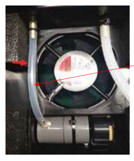
New design exhaust tube PN 21497188

All units produced as of August, 2021 will have new exhaust tube material, starting with serial number GPB0121320001. The old design exhaust tube is made of PVC and the new design exhaust tube is made of silicone. The part number for the new exhaust tube is 21497188. Please see the pictures below.