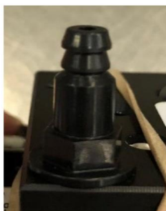
Figure 1. Spirit POC Plastic Barb

As of October 2018, the OCD Assembly will have an aluminum barb. The change is to meet an IEC 60601 3rd edition requirement. It also will stop a cannula fire at this fitting, to avoid progression to the Spirit. Aluminum barb Part number: 21328868 FITTING BARB, SPIRIT O2 OUTLET.