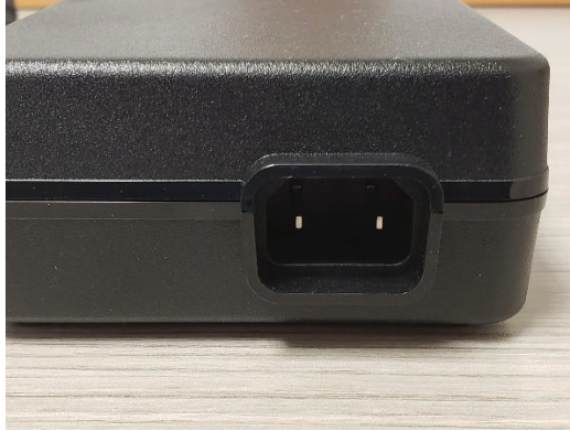
Figure 1: Current Eclipse 5 power supply (PN 21334759)