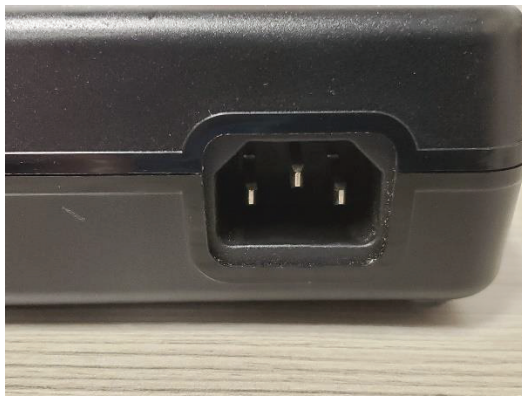
Figure 3: Eclipse 3-LED Power Supply (PN 5940-SEQ)

Figure 3 displays the power supply connection for use on the 3-LED version Eclipse models. These part numbers are obsolete, replaced by the power supply kits listed above.