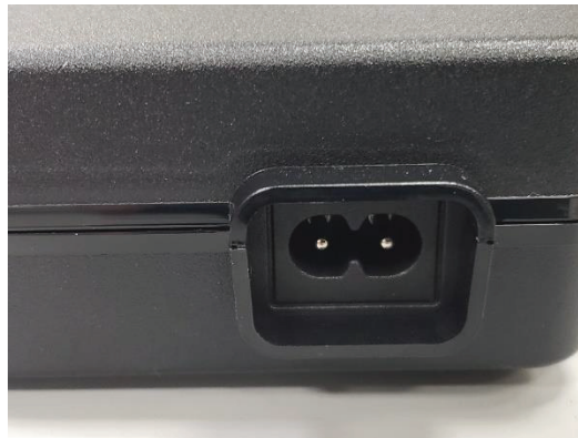
Figure 2: Previous Eclipse 5 power supply (PN 20852326)

Figure 3 displays the power supply connection for use on the 3-LED version Eclipse models. These part numbers are obsolete, replaced by the power supply kits listed above.