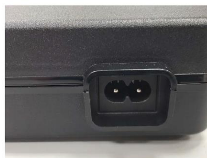
Figure 2: Previous Eclipse 5 power supply (PN 20852326)