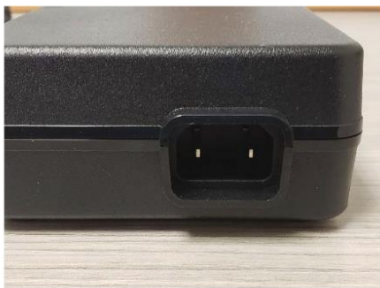
Figure 1: Current Eclipse 5 power supply (PN 21334759)

Figures 1 and 2 display the different power connections between the new part number 21334759 and the previous part number 20852326. The 21334759 new style power supplies will require different power cable – see Table 2 for details of different cord part numbers.