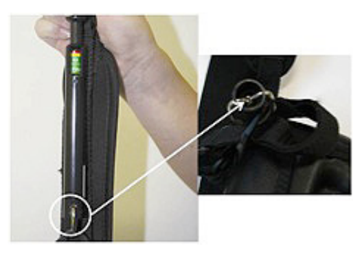
Figure 5 -- Contents Indicator Scale Calibration

The scales used on the HELiOS and Companion portable units cannot be calibrated. They must be replaced if they read inaccurately.