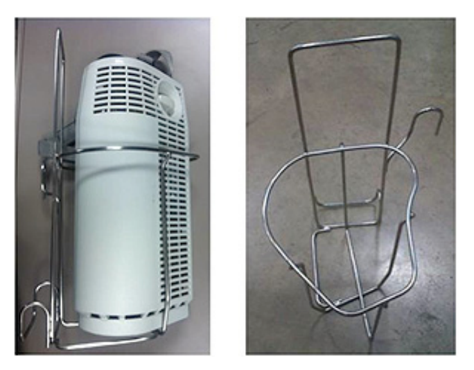
Figure 8 -- Companion Wheelchair Basket

A wheelchair basket is available to safely carry the C1000 & C1000T portable units on the back of a wheelchair. The basket, shown below, can be ordered using part number #B-775538-00.