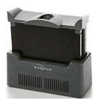
Figure 7 -- Eclipse Desktop Charger