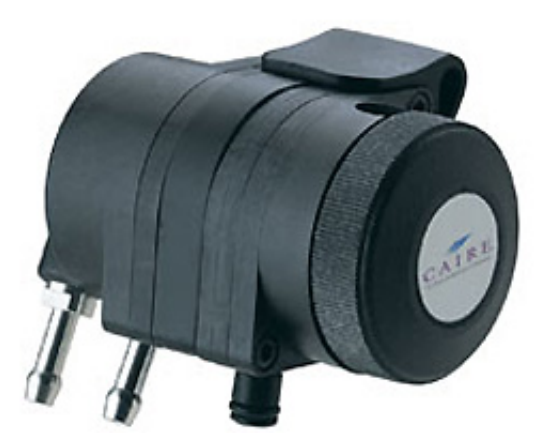
Figure 9 -- OxiClip PC 20

The OxiClip PC 20 Pneumatic Oxygen Conserver (P/N B-702120-00, B-701420-00, B-701442-00, & B-701855-00) will be obsolete once current inventory is sold. Market demand did not support continued production.