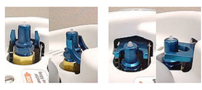
Figure 6 --Universal Reservoirs (U36 & U46)

A: The easiest way to tell is to look at the QDV (fill connector) and the pop-off assembly that surrounds it. The pop off assembly on Standard reservoirs is flat, whereas it is curved upward on the Universal reservoirs. Also, the QDV on Standard reservoirs is recessed further than the universal reservoirs. This is the main reason that it will only fill HELiOS portables.