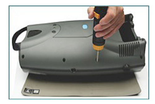
Figure 1 - Eclipse Removal and Installation of Screws