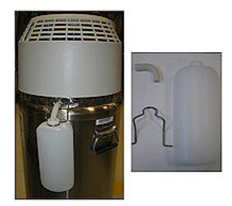
Figure 2 -- Companion Reservoir Drain Bottle Kit

A drain bottle kit is available for the Companion Reservoirs. The kit contains the drain bottle, the bracket used to attach it to the reservoir, and the tubing elbow to route the moisture. The kit can be ordered using part number #B-701362-00.