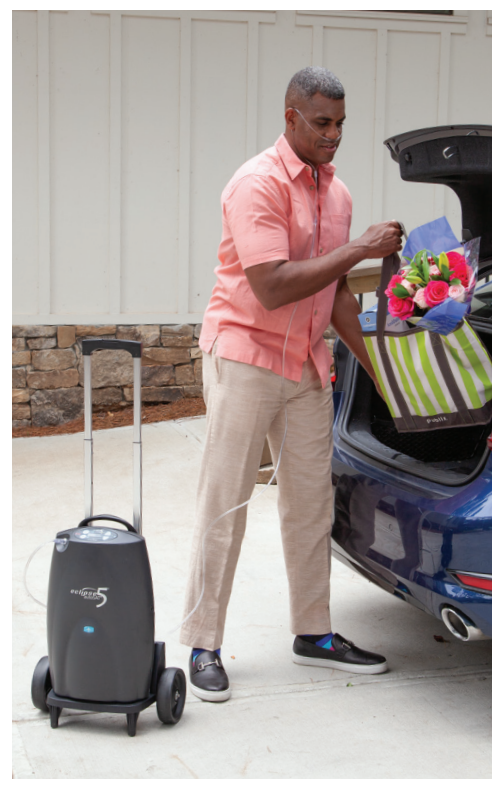
User Manual (US)