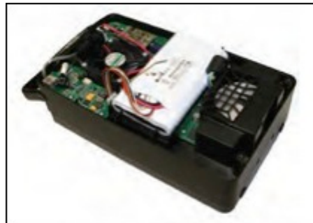
FreeStyle 5 Internal Battery PN: BT021-1S