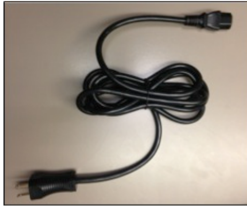
Hospital Grade Power Cord PN: CD023-2

conventional plugs and can be identified by a green dot at the plug. Hospital grade power cords for Eclipse, LifeStyle, FreeStyle, FreeStyle 5, and Focus universal power supplies may be ordered using PN: CD023-2 . This product is UL Listed and CSA certified and is 8 ft (2.4 m) in length.