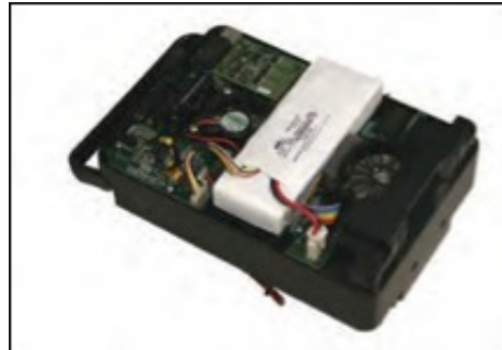
FreeStyle Internal Battery PN: BT018-1S

A replacement internal battery can be ordered for both the AirSep FreeStyle and FreeStyle 5 portable oxygen concentrators. The internal battery for the FreeStyle may be ordered using PN: BT018-1S and the internal battery for the FreeStyle 5 may be ordered using PN: BT021-1S .