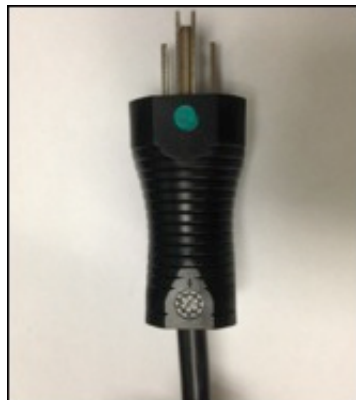
Green Dot Marking on Plug