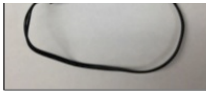
Thermistor Temperature Probe PN: WH109-1