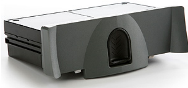
Eclipse Power Cartridge (Battery) PN: 7082-SEQ