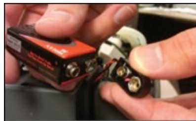
9 Volt Battery PN: 8098-SEQ (If you order the PM kit, 5022- SEQ, this is included)