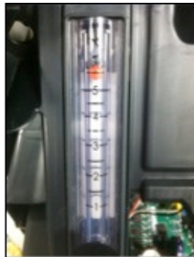
Flow Meter with Ball at 5.5 LPM

A: If the pressure regulator on the stationary oxygen concentrator is not properly adjusted, the ball of the flow meter will fluctuate. The first step in troubleshooting this issue is to verify the regulator is properly adjusted. Please use the procedures listed below to adjust the regulator for normal operation. The VisionAire and NewLife Elite regulators are adjusted to flow and the NewLife Intensity and Intensity 10 regulators are adjusted to pressure.