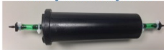
Green tubing and reducer fittings installed