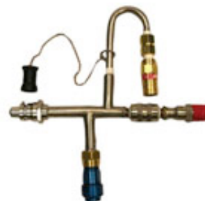
CAIRE Dual Fill (Top & Side) Adaptor #10897958