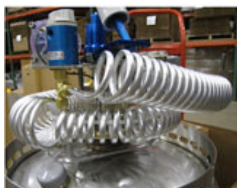
Side View of 3-Port Vaporizing and Breathing Coils

3-Port Manifold: This is the model used in current production. These tanks have a combination R/E valve and the SRV is mounted on top of the R/E valve. The outlet from the manifold to the coils is a direct compression fitting with a nut and ferrule. These models have two tiers of tightly-wound warming coils: the vaporizing coil and the breathing coil. All reservoirs produced after July 2011 have this style of manifold.