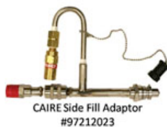
CAIRE Side Fill Adaptor #97212023

Pictures and part numbers for these are below.