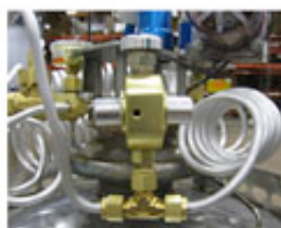
Relief/Economizer (R/E) Valve