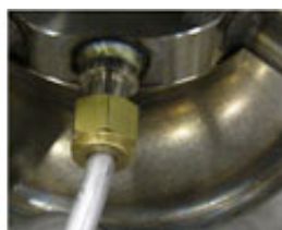
Manifold to Coil Connection