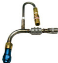
CAIRE Top Fill Adaptor