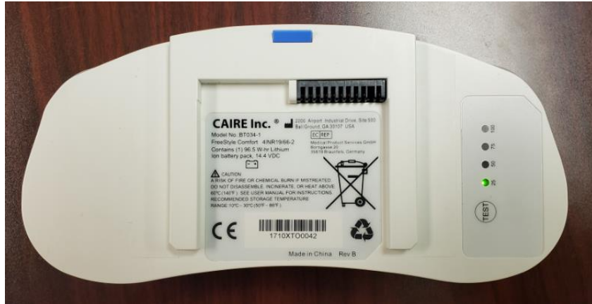
Figure 2: FreeStyle Comfort Battery Indicating 25%

Given this requirement, any units received from end users should always be plugged in and allowed to charge to prevent misinterpreting a low battery alarm as a warranty return (i.e. Comfort alarm codes 0100 or 0010). See Figure 3 below.