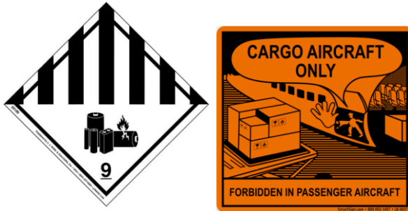
Figure 5: UN Class 9 Lithium Battery Label and Cargo Aircraft Only Label

Lithium ion batteries packed by themselves are forbidden for transport as cargo on passenger aircraft unless shipped under exemption issued by all states concerned, and appropriate Class 9 label and/or Cargo Aircraft Only label attached. See figure 5 below.