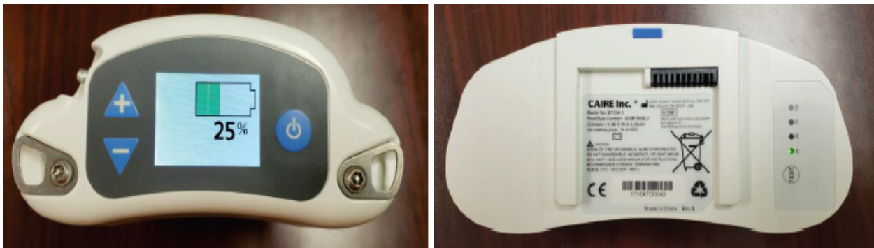
Figure 1: FreeStyle Comfort Battery below 30%

All shipments containing lithium ion (Li-ion) batteries require updated warning labels. Lithium ion batteries packed by themselves must be shipped at a state of charge not exceeding 30% of their rated design capacity. Cells and/or batteries at a state of charge greater than 30% may only be shipped with the approval of the State of Origin and the State of the Operator under the written conditions established by those authorities. See Figure 1 below.