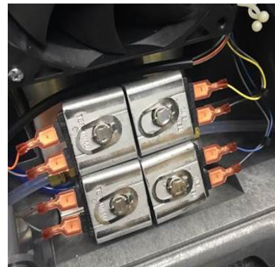
New Metal Clip Retainer