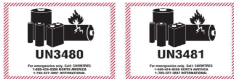
Figure 2: UN3480 and UN3481 Label Examples

Label UN3480 should be used for Li-ion batteries or power cartridges packed by themselves (CAIRE PN: LA454-1). Label UN3481 should be used for Li-ion batteries or power cartridges packed with equipment (CAIRE PN: LA454-2). See Figure 2 below.