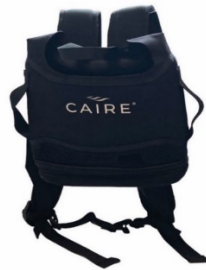
Figure 5: Freestyle Comfort Backpack MI459-1

We are pleased to announce the availability of the new Backpack for the Freestyle Comfort Portable Oxygen Concentrator (POC). This can be ordered using part number MI459-1.