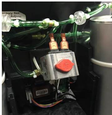
Old Red Cap Retainer

Please note the valve retainer clips on the NewLife units has changed. The red plastic caps are no longer in use and have been changed to metal clips (see pictures below). The part number has remained the same, HA064-1.