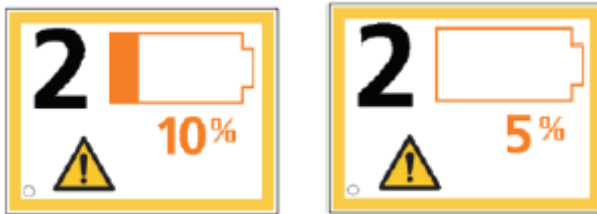
Figure 3: Comfort Low Battery Warnings

Given this requirement, any units received from end users should always be plugged in and allowed to charge to prevent misinterpreting a low battery alarm as a warranty return (i.e. Comfort alarm codes 0100 or 0010). See Figure 3 below.