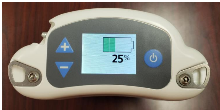
Figure 1: FreeStyle Comfort Battery below 30%

Lithium ion batteries packed by themselves must be shipped at a state of charge not exceeding 30% of their rated design capacity. Cells and/or batteries at a state of charge greater than 30% may only be shipped with the approval of the State of Origin and the State of the Operator under the written conditions established by those authorities. See Figures 1 and 2 below.