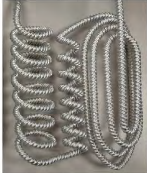
New Design TU303-1

Please refer to Service Bulletin PN 21500493.