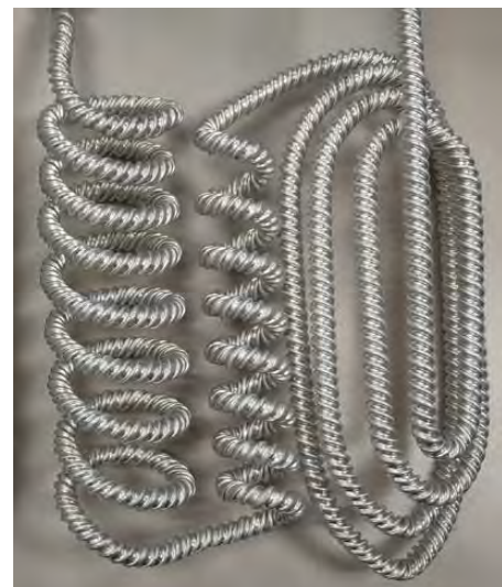
New Design TU303-1

Please contact your local Sales Representative or our Customer Service, or Technical Service teams for assistance with any inquiries or concerns.