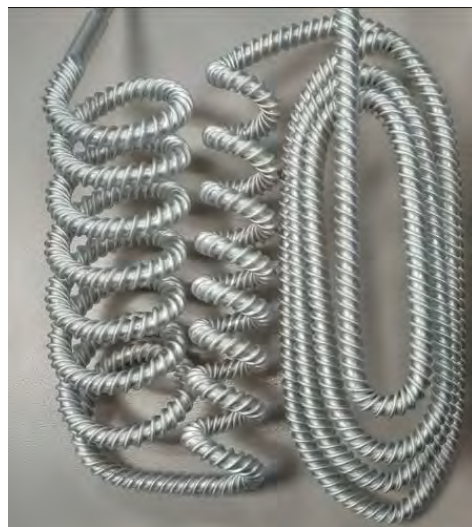
Current Design 10650277

NOTES: Effective January 15, 2025, the convoluted tubing for the vaporizer on the Stroller and Sprint units will have a different form due to a change on the manufacturing process. The new coils are backwards compatible with the current design. The part number for the new design coil is TU303-1. Please see below pictures.