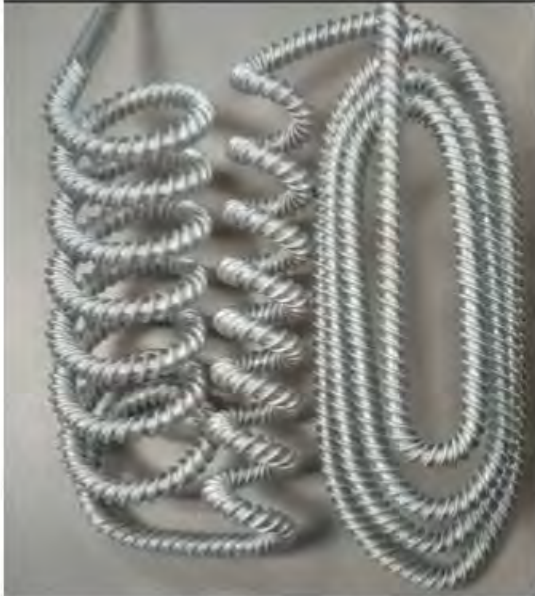
Current Design 10650277

Effective January 15, 2025, the convoluted tubing for the vaporizer on the Stroller and Sprint units will have a different form due to a change on the manufacturing process. The new coils are backwards compatible with the current design. The part number for the new design coil is TU303-1. Please see below pictures.