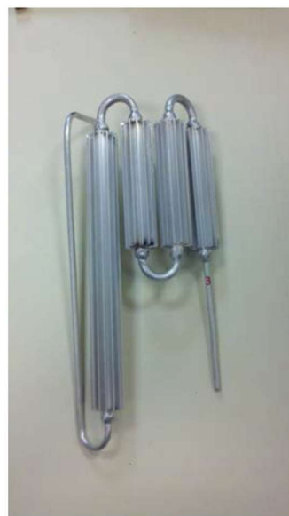
New Design #20534899-SV

(Figure 1 - - Companion 1000T Heat Exchanger Coil Change)