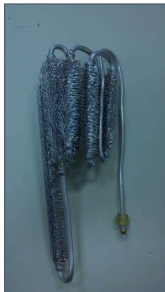
Old Design #B-775528-00

The new style fin heat exchanger replaces the spine tube heat exchanger, shown in Figure 1. The new heat exchanger coil, #20534899-SV, is also a direct replacement for any older style units. The new assembly will use the same nut and ferrule design as, #B-775528-00, that it is replacing. The flow rate and output temperature are not affected by this new design.