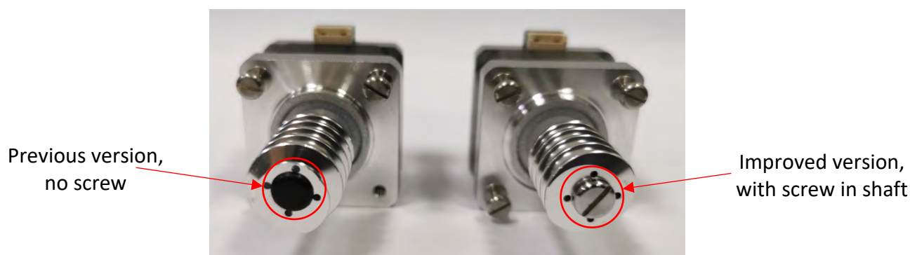
Figure 3 – Top side of stepper motor

CONTACT: For technical questions or concerns, contact Technical Service: